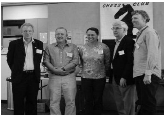
BCC COMMITTEE 2016